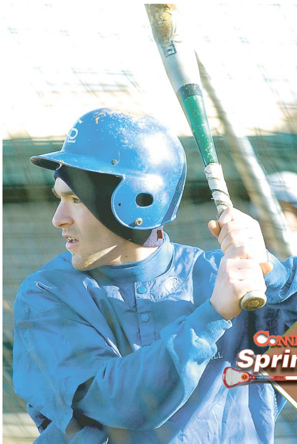
South Lakes posted a 7-14 record last season and was knocked out of the Liberty District tournament after a 9-0 loss to Langley.